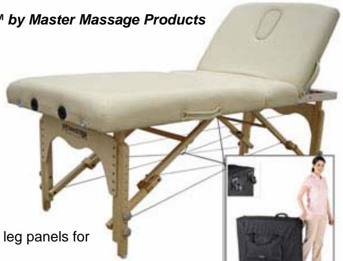
Wheeled Carrying Case Included!

The carrying case, too, is the best in the business. Its ball bearing wheels, full length extra strong base plate, and ergonomically placed handles make transporting these tables a breeze!